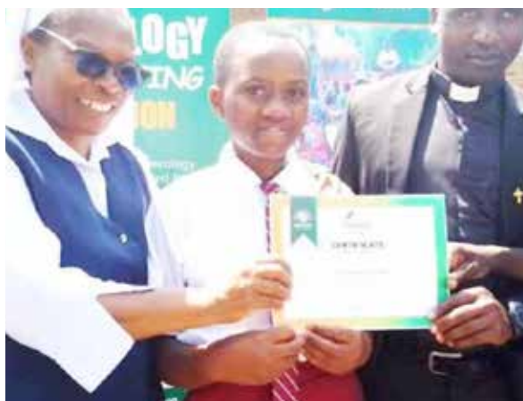
A National Poem Writing Competition about Agro ecology was organized back in June by Eastern and Southern Africa Small-scale

Farmers' Forum (ESAFF) to promote awareness about the dangers of using Agrochemicals.