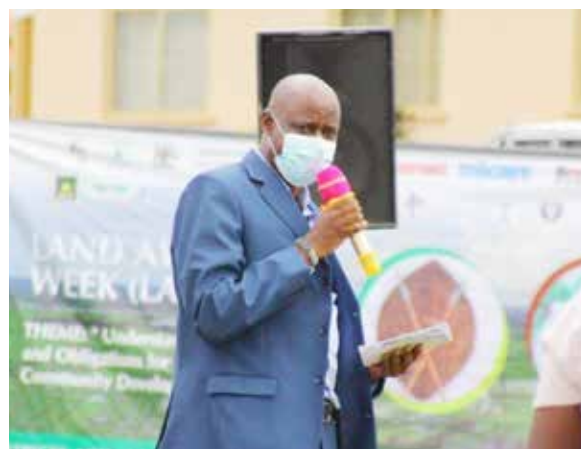
The fifth Annual National Organic Week is back. The 2023 event will focus on promoting agroecological farming techniques and healthy food in the country.