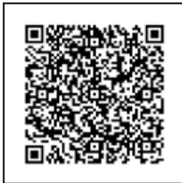
By Racheal Nabisubi, Daily Monitor